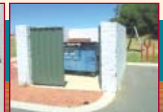
Good housekeeping—lockable dumpster bin in secured enclosure away from premises.