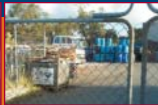
Chemicals and gas cylinders behind security gates.