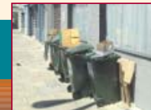
Bins unsecured and close to premises—an invitation to an arsonist.