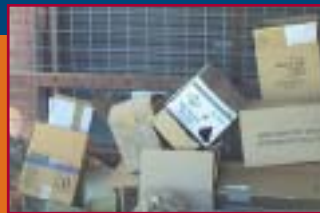
Waste stored in a caged area.

Such systems would detect a fire and help control it until the Fire Service arrives. Ensure portable firefighting equipment is serviced to Australian Standards.